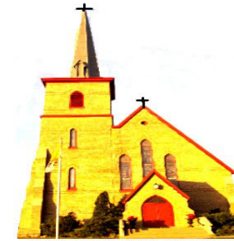
ASSUMPTION OF THE BLESSED VIRGIN MARY CHURCH