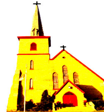
ASSUMPTION OF THE BLESSED VIRGIN MARY CHURCH

"SO THEY ARE NO LONGER TWO, BUT ONE FLESH"