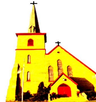
ASSUMPTION OF THE BLESSED VIRGIN MARY CHURCH

LORD, WHAT MUST I DO TO INHERIT ETERNAL LIFE?"