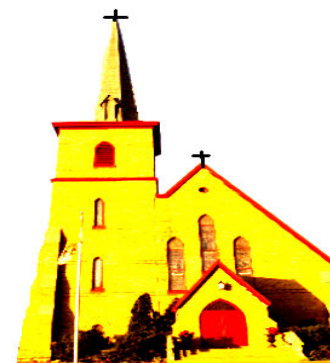
ASSUMPTION OF THE BLESSED VIRGIN MARY CHURCH

"MASTER, GRANT US TO SIT, ONE AT YOUR RIGHT