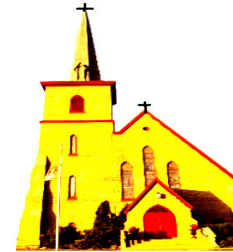
ASSUMPTION OF THE BLESSED VIRGIN MARY CHURCH

"THIS WIDOW OUT OF HER POVERTY HAS PUT IN EVERYTHING SHE HAD"