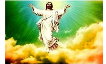
“THE SON OF MAN IS COMING IN CLOUDS WITH GREAT POWER AND GLORY”