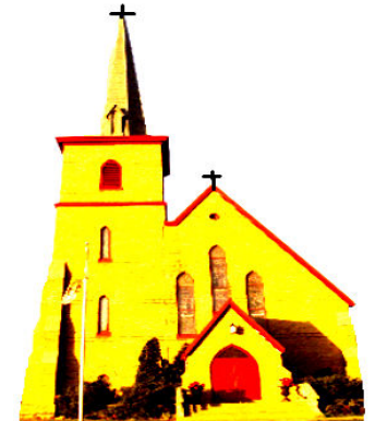
ASSUMPTION OF THE BLESSED VIRGIN MARY CHURCH